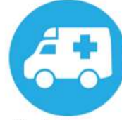
Incident Management & RIDDOR