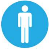
Lone Working Awareness