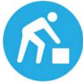
Manual Handling Awareness