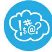
Violence, Aggression & Bullying Awareness