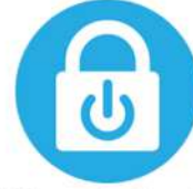
Information Security Awareness