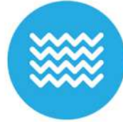
Vibration (HAVS) Awareness