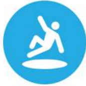
Slips, Trips & Falls Awareness