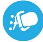
Office Safety Awareness