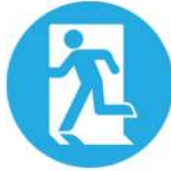
Entrances, Exits & Signs Awareness