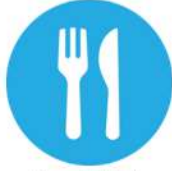
Food Safety Awareness