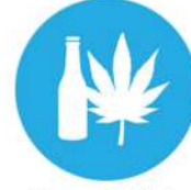
Drugs & Alcohol Awareness