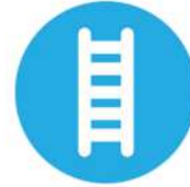
Working at Height Awareness

We can also develop any bespoke e-learning content you may require, or provide support if you plan to create your own e-learning content. As an accredited training provider, we can assist with getting courses certified by RoSPA, IIRSM and/or CPD.