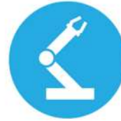
Plant & Machinery Awareness