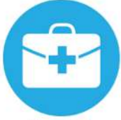
First Aid in the Workplace