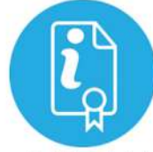
Health & Safety Induction